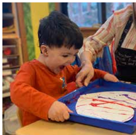
Student Conduct 58