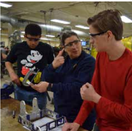
Class Organizations/ Service Clubs 48