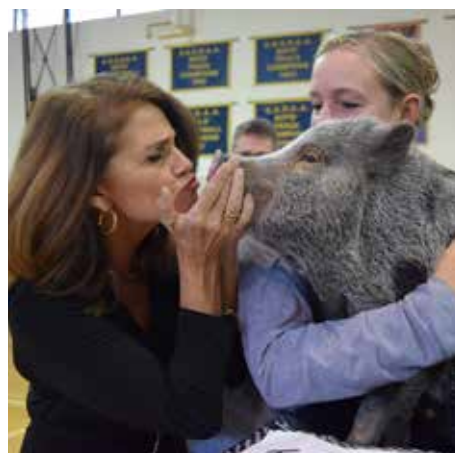
Conduct Code 65