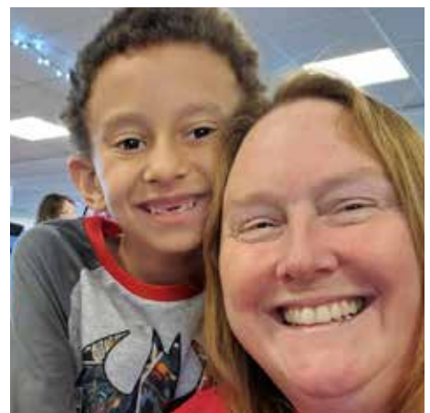
Policy on Communication 10