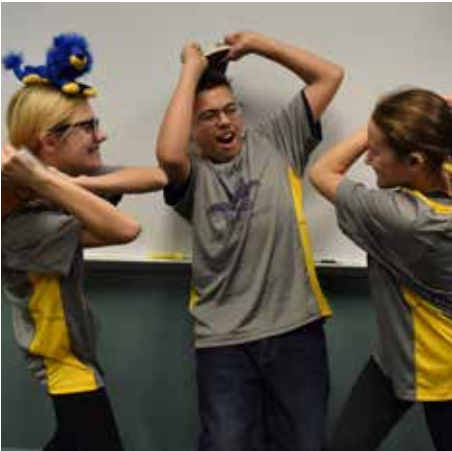
Residential Life 44