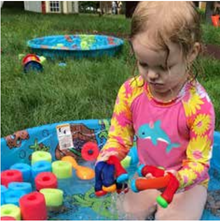
Choices for Children 29