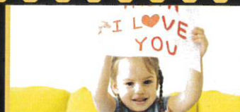
sending a message