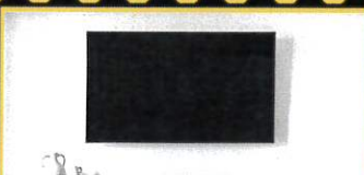
displayed on the tv's throughout the school