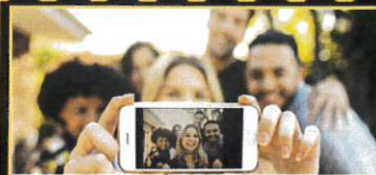
a photo or a 5 second video