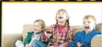
to your child