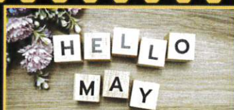
during the month of May